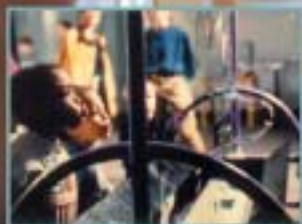
GREAT LAKES SCIENCE CENTER

Bouncing from attraction to attraction by day. Hotel bed to hotel bed by night.