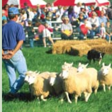
Bob Evans Farm Festival

Experience the rural America of yesterday. More than 150 crafters and artisans demonstrate their work, many using tools and techniques nearly forgotten today including leatherworking, blacksmithing and spinning.