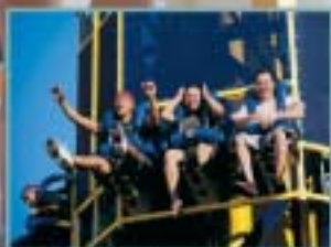
GEAUGA LAKE AMUSEMENT PARK