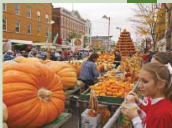
Circleville Pumpkin Show