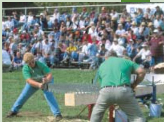
Paul Bunyan Show