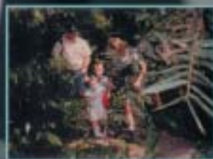
THE RAINFOREST - CLEVELAND ZOO