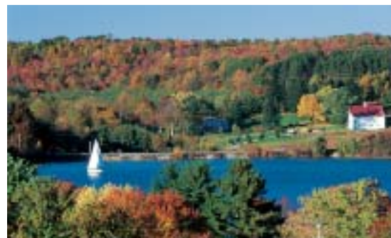
Beautiful scenery surrounds Whispering Pines Bed & Breakfast, Atwood Lake.

Massages are conducted in the privacy of your room, and packages are available. The "Deluxe Massage Package" delivers a one-hour full-body massage for two, a gift set including two plush Whispering Pines terry-velour robes, the 3 rd edition of the Inn cookbook and a set of Whispering Pines coffee mugs filled with Swedish-made Arbonne products. Each of the