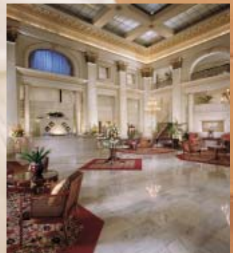
The Marengo Institute Day Spa, located in the grandeur of the Westin Hotel, Columbus.

If you yearn for the ultimate spa retreat, then the "I Deserve the Decadence" package will lavish you with all the spa services you want from 10 a.m. to 6 p.m., complete with breakfast and lunch. A variety of spa packages are available and many include accommodations at the Westin where you can enjoy the "Heavenly Bed" and Queen Anne-style furnishings.