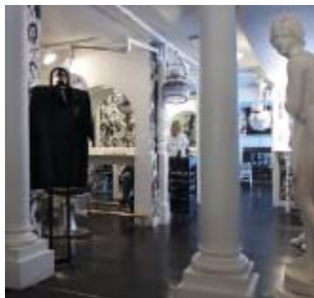
A rejuvenating experience awaits at Mario's International Spa, Aurora.

If you desire more of a therapeutic or intimate spa experience, visit the Spa Sanctuary located across the street from the