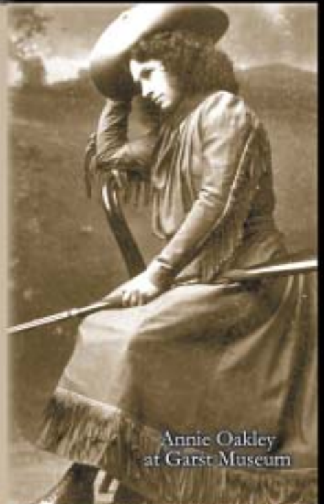
Annie Oakley at Garst Museum

Quote from Norman Vincent Peale, author of Power of Positive Thinking and one-time resident of Darke County.