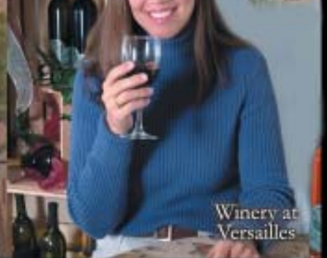
Winery at Versailles