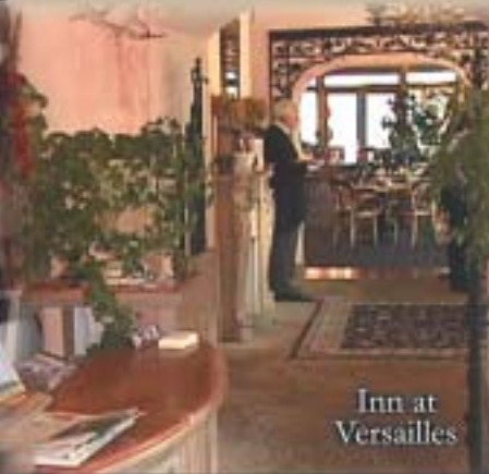
Inn at Versailles