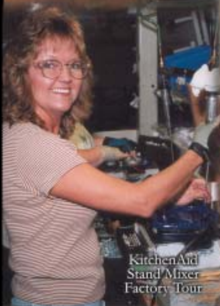
KitchenAid Stand Mixer Factory Tour

"Change your thoughts and you change your world."